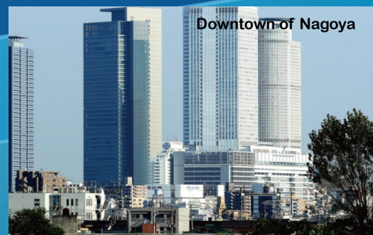
Downtown of Nagoya

The exchange students stay at partner universities as visiting scholars and conduct independent research. As of 2018, JUACEP has formed cooperative relationship with UCLA, Univ. Michigan and Univ. Toronto. Selected students will stay at Nagoya University for about 10 weeks, as well Nagoya students do in those universities. Scholarship will be awarded to qualified students.